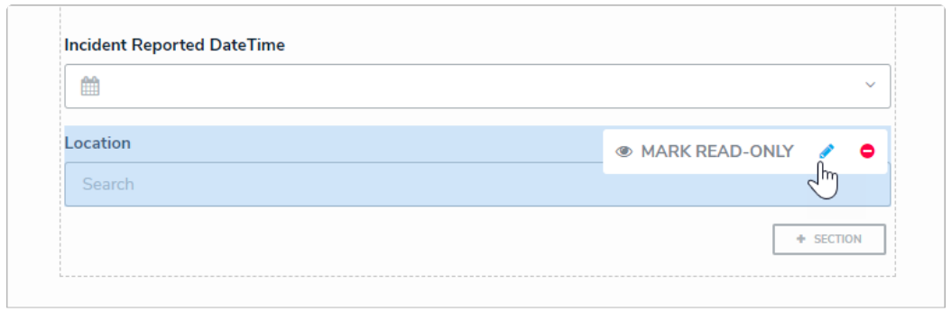
The Location property on the form canvas.