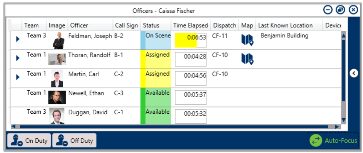
The Officers panel.

To open Officers in a floating panel, click Officers in the ribbon.