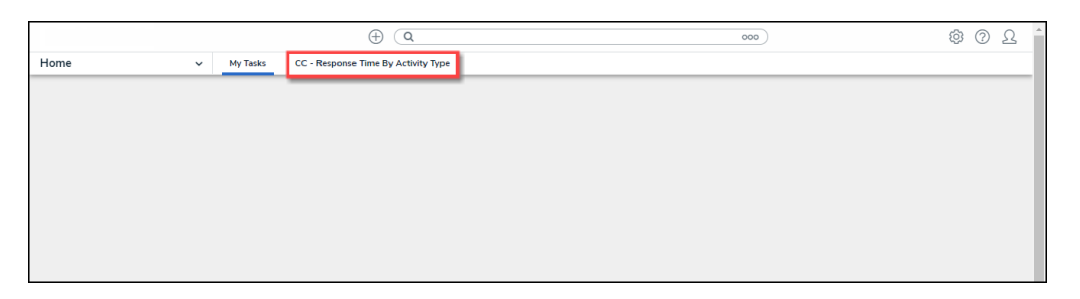
Starred Report Tab

Starred Reports will appear in the Tab section on the user's Home screen, next to the My Tasks tab. The system uses the Report's name as the name of the Tab on the Home screen.