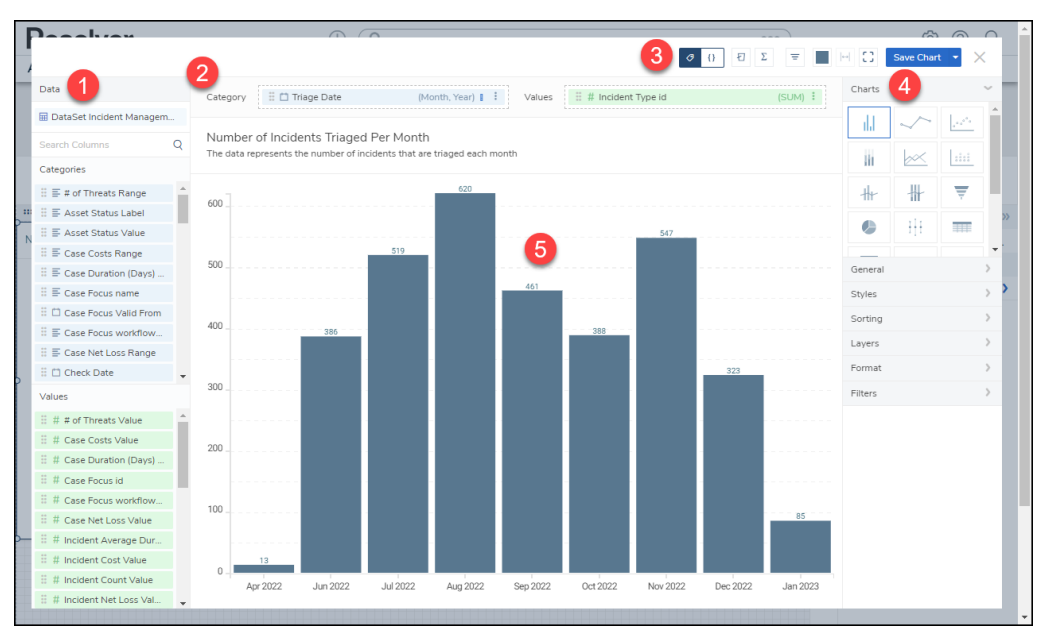
Chart Screen Elements Overview

2. The screen elements that appear on the Chart screen are listed below: